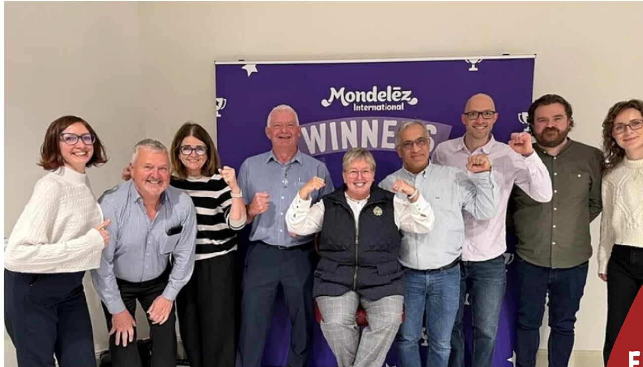
CAREERS AND PEOPLE, UK, MANUFACTURING, CULTURE